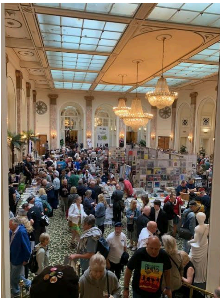
The 2023 Liverpool Beatles Convention Marketplace/Vendor Ballroom.