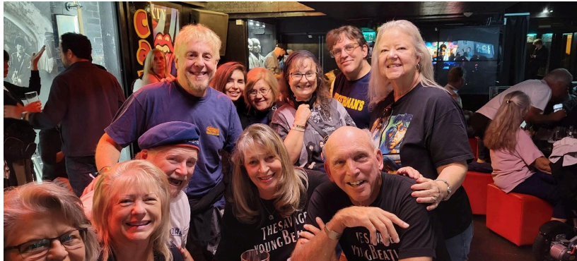
Inside the Cavern Club.

We can only imagine how much fun it must have been to see The Beatles at the Cavern Club before they became world famous. What a great way to end our tour! So many artists have played there including The Rolling Stones, The Who, The Kinks, Rod Stewart, Chuck Berry, Herman's Hermits, Queen, and, more recently, Adele. How lucky are the people of Liverpool?