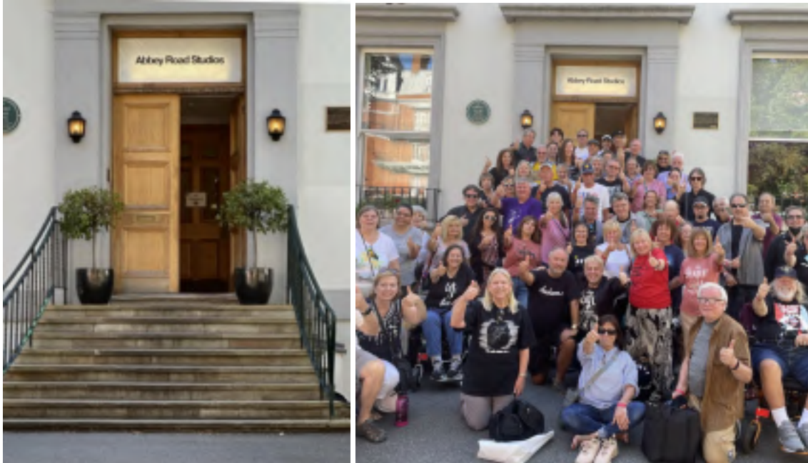
Abbey Road Studios Entrance Before We Entered and then our Group Photo

At 3:00 PM we had a very important appointment at Abbey Road Studios! We signed our names on the stone wall in front of the building, then we gathered on the steps in front of the door for some group photos, before ENTERING INSIDE the building.