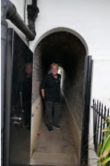
Charles!!! Inside the City Barge Alleyway from the film HELP!

Our first Beatles stop was Chiswick Park, full of trees, flower gardens and ponds, and large stone statues, as well as the 18th century Roman style Palladian Villa, The Chiswick house. It was here in the park that The Beatles had their photos taken among the statues and trees in 1966, for the promotional films for their songs "Paperback Writer" and "Rain. We traveled to the City Barge near the 1 Thames River where some of the scenes for the Beatles movies "Help!" and "A Hard Day's Night" were filmed.