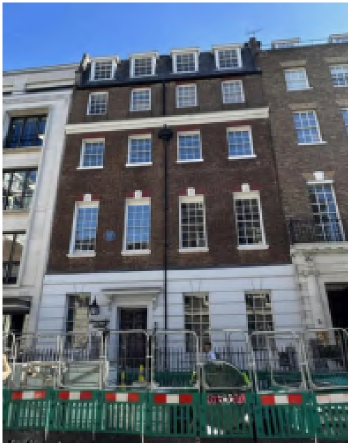
3 Saville Row

After a buffet breakfast in the hotel, we gathered for a walking tour of London. It was a beautiful warm and sunny day. We saw The Blue Gardenia, a nightclub where the Beatles made a late night impromptu performance on December 10th, 1961, after a disastrous show at the Palais Ballroom in Aldershot, a city 31 miles south of London. We saw Trident Studios, where The Beatles recorded "Hey Jude," as well as several other songs in July 1968 including "Dear Prudence," "Honey Pie," and "Martha My Dear." Other Beatle-related artists such as Billy Preston, James Taylor, Badfinger, Mary Hopkins, and Harry Nilsson also recorded there. We saw MPL Productions, Paul McCartney's music publishing company. A short distance away is the New Burlington Police station. It was from here the Bobbies were called because of multiple noise complaints when the Beatles staged a rooftop concert on top of 3 Savile Road, the Apple Corps Headquarters, on January 30th, 1969. The building is still there, and we loved visiting it, but of course it is no longer Apple. It wasn't hard to imagine the excitement of the noontime crowds when they could hear the music, but quite couldn't tell where it was coming from. They never realized this would be The Beatles' last live performance!